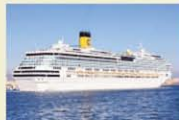
STILL AFLOAT Cruises will be back