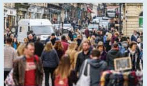
WORRYING Shoppers are leaving high streets

Animals are becoming more bold as humans stay indoors. More moles, stoats and weasels have been spotted. We must remember how beautiful our environment is when we aren't trampling all over it.