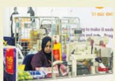
UNSUNG Supermarket worker

Across the West, nations have turned inwards rather than looking for ways to cooperate. The big challenge will be to once again make the case for openness and connectivity. If the UK is to achieve its vision for "a truly Global Britain", we will need to lead from the front.