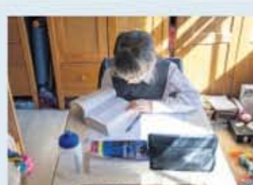
CHANGE Kids have learned at home

You can't put that genie back in the bottle.