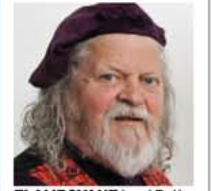
FLAMBOYANT Lord Bath

That goes for their pay, education and training and the tools to do the job. One part of this pandemic's legacy must be for politicians never again to run services on a shoestring.